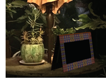
Maasai Solar Module lights up a summer night in the city.

Maasai Solar Modules are codesigned by the Land Art Generator Initiative, Olorgesalie Maasai Women Artisans (OMWA), and Idia'Dega, and handcrafted by OMWA with traditional Maasai beadwork. Each is a unique piece of renewable energy artwork.