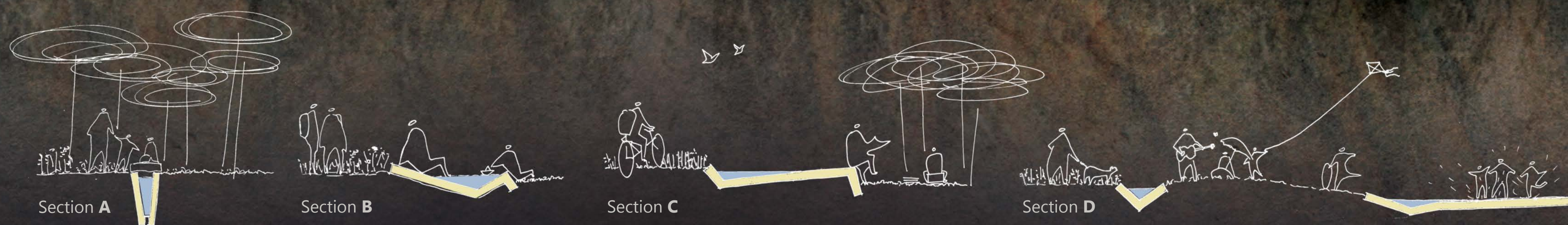
Moments along the Spiral Channel where people can interact with river water .

The physical form of Rio Iluminado has 4 components: the River Well , the Spiral Channel , the River Platform , and the Solar Arch . Why is it when we visit an ancient site like Machu Picchu or Stonehenge we feel something special, physical, and indescribable? In the way that one can feel the intentions of an artist radiate from the canvas without even one word of explanation from the artist herself, the places we make have the same capacity to embody and communicate a purpose – even provoke transformation. It is with this level of intentionality that we approached the site, its restoration, and the making of a new place for Willimantic.