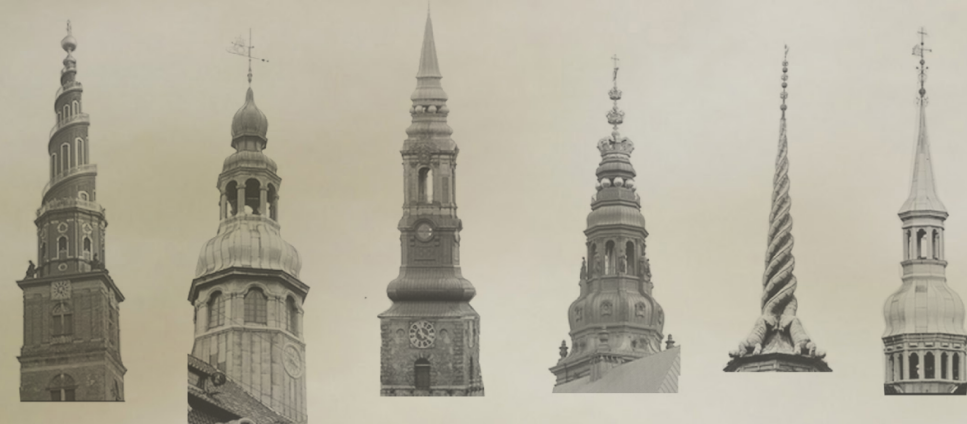
Notable spires in Copenhagen

Drawing on the picturesque skyline of Copenhagen's prolific church spires, Windspire serves as an abstracted vision of one of this prominent Danish city's strongest visual queues. The form of the spires is derived from the appearance of several prominent Copenhagen church spires, and then abstracted and inverted in order to achieve maximum functionality and constructibility. The spires' siting acts as a gateway to introduce visitors to the valuable institution of wind energy that which has so prolifically manifested in Copenhagen proper, and Denmark beyond.